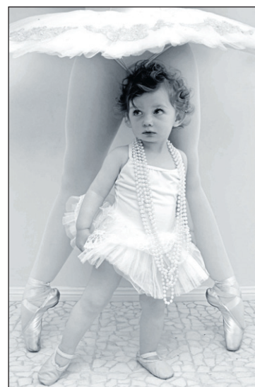
LITTLE STAR: Stepping Out Dance Factory is proud to offer the exclusive Angelina Ballerina preschool dance curriculum.

Stepping Out Dance Factory is the only dance school in the area