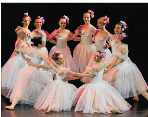
ON STAGE: Colour City dancers perform.

COLOUR City Dance endeavours to develop children's lifelong love of dance and the performing arts.