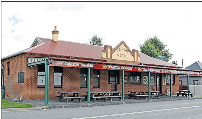
The Railway Hotel Spring Hill.

THE team at the Railway Hotel Spring Hill are gearing up for New Years Eve with live music by the hard-rocking Millthumpers from 7pm.