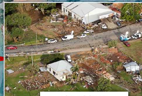
DOWLING STREET Four houses swept away