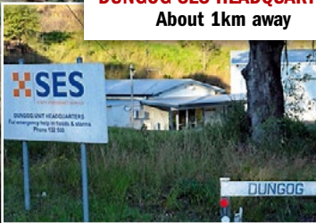
DUNGOG SES HEADQUARTERS About 1km away