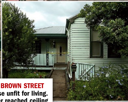
38 BROWN STREET House unfit for living. Water reached ceiling