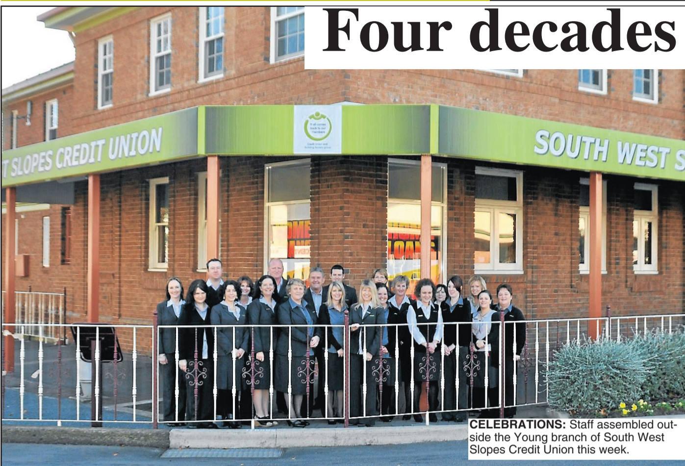
CELEBRATIONS: Staff assembled outside the Young branch of South West Slopes Credit Union this week.

South West Slopes Credit Union is a community credit union operating in the south-west country area of NSW Australia.