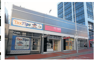
216-222 Keira Street bought for $725,000 in Jan 1989

OTHER WIN-OWNED WOLLONGONG PROPERTIES NOT PICTURED: ■ Multi residential dwelling at 19 Smith Street bought for $1.01 million in Mar 1998. ■ Commercial strata unit property at 19/26 Church Street bought for $305,000 in Nov 1984.