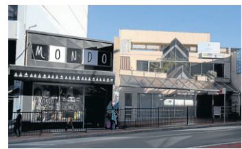
231 Crown Street bought for $740,000 in Sep 1997