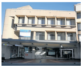
243 Crown Street bought from the Commonwealth Bank of Australia for $6.02million in Mar 2014