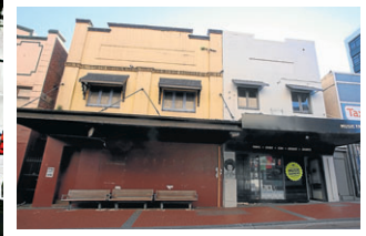
232-234 Keira Street bought for $470,000 in Jul 1990