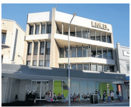
253 Crown Street bought from the Illawarra Mutual Building Society for $6.25million in Feb 2015