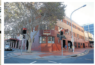
86 Burelli Street which includes The Grand Hotel. No details available of sale price or date.