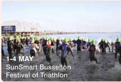
1-4 MAY SunSmart Busselton Festival of Triathlon