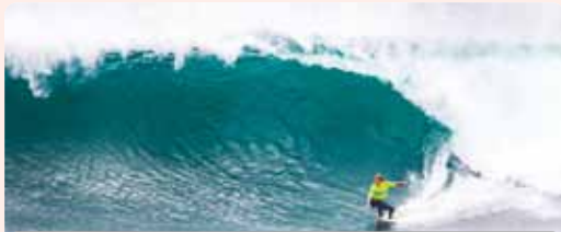
2-13 APR Drug Aware Margaret River Pro