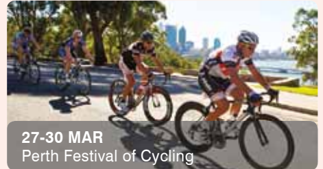
27-30 MAR Perth Festival of Cycling