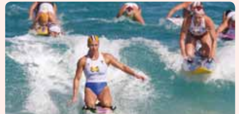
31 MAR-6 APR Australian Surf Life Saving Championships, Perth