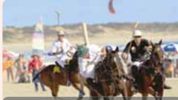
24-25 MAY Pinctada Cable Beach Polo Festival, Broome