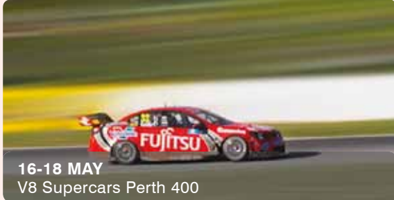
16-18 MAY V8 Supercars Perth 400