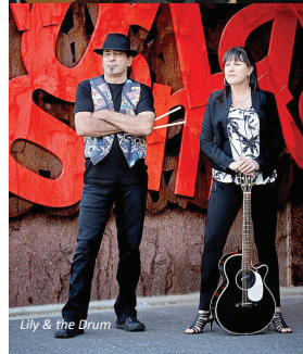
Lily & the Drum