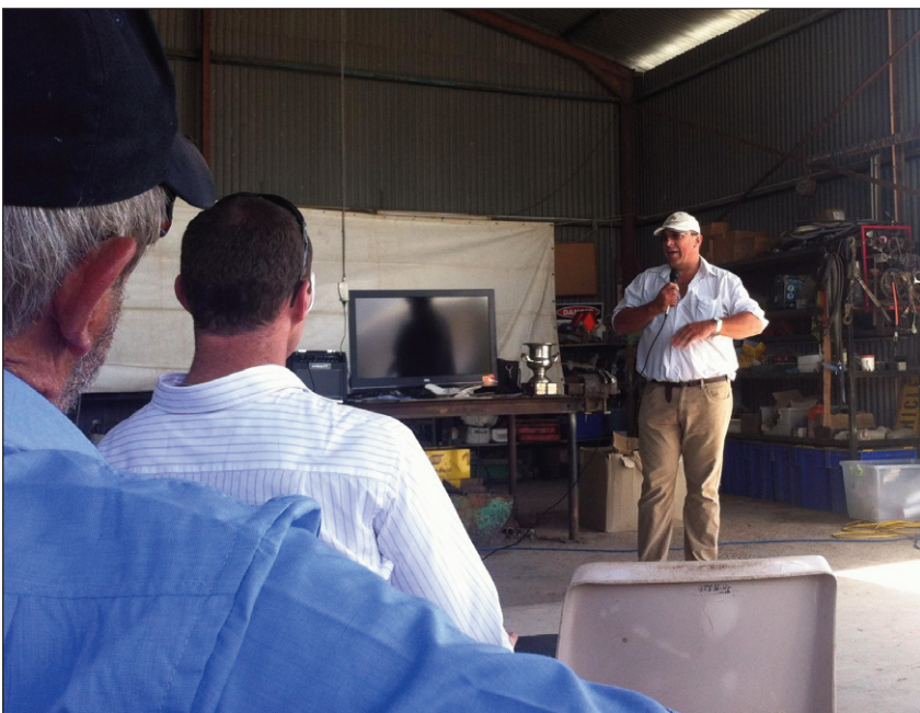
Attendees listen to last year's presentation for dryland farming.

Proud sponsor of the 2014 MacIntyre Valley Cotton Field Day