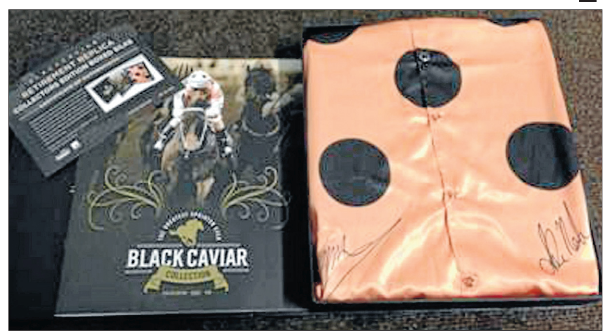
The silks are signed and ready to be taken by the highest bidder.

RAISING funds for the local hospital is the goal for this year's gala fundraiser dinner.