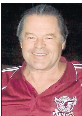
Another of his loves - Manly www.moreechampion.com.au