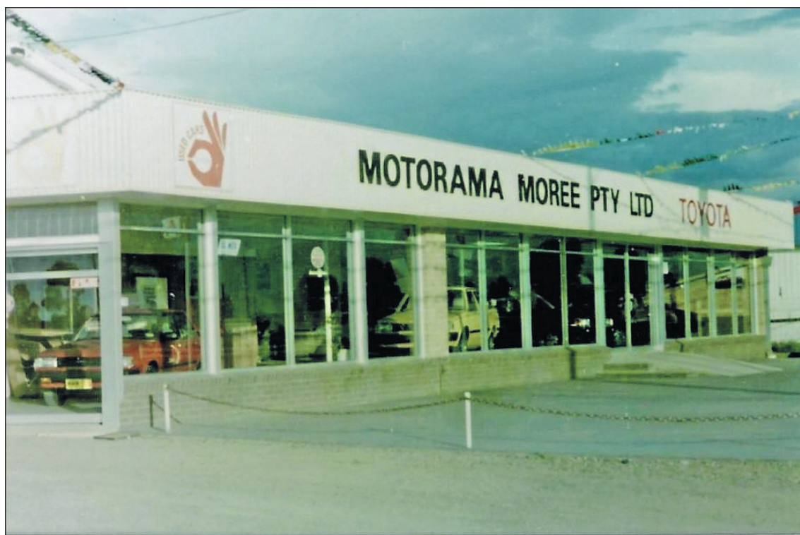
LAST PHOTO of MOTORAMA MOREE PTY LTD in NOVEMBER 1983