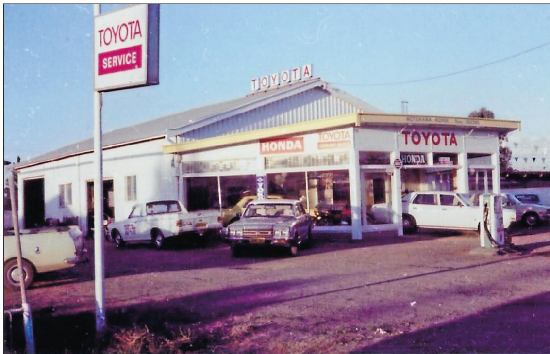
SHOWROOM & WORKSHOP 1977