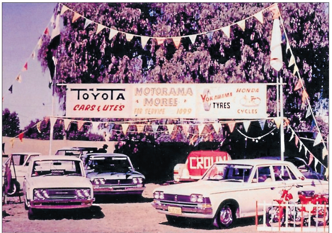
MOREE SHOW STAND MAY 1968